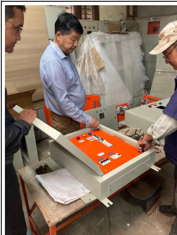
Fig 15. Visit at Hyonjan Electrical Engineering Fabricator Pvt Ltd for DB box specification.