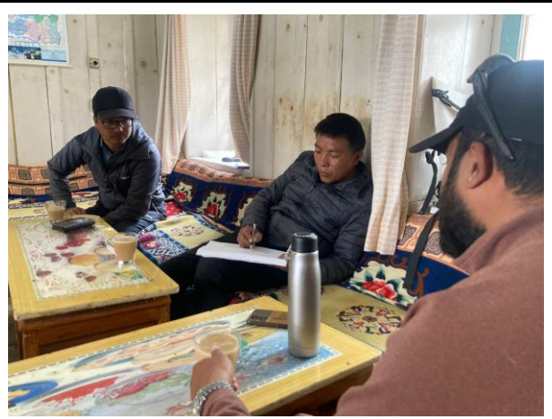
Fig 18. Consultation with KBC Technician