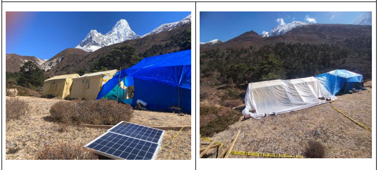
Figure: Labor Camp at Construction Site (Powerhouse)