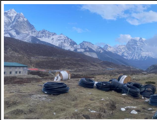
Fig 17. Transport of LT Cable at Pheriche.