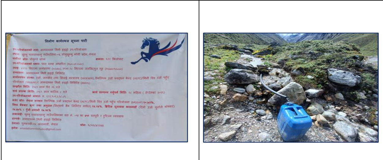
Figure: Project information board at construction site