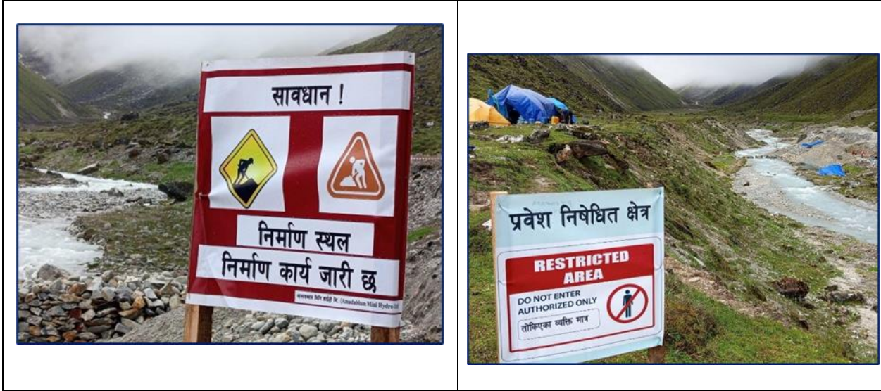
Figure: Existing Construction Signages