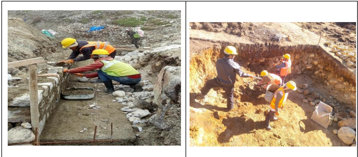
Figure: Labor are working at construction site