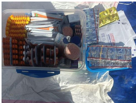
Figure: First aid box at construction site