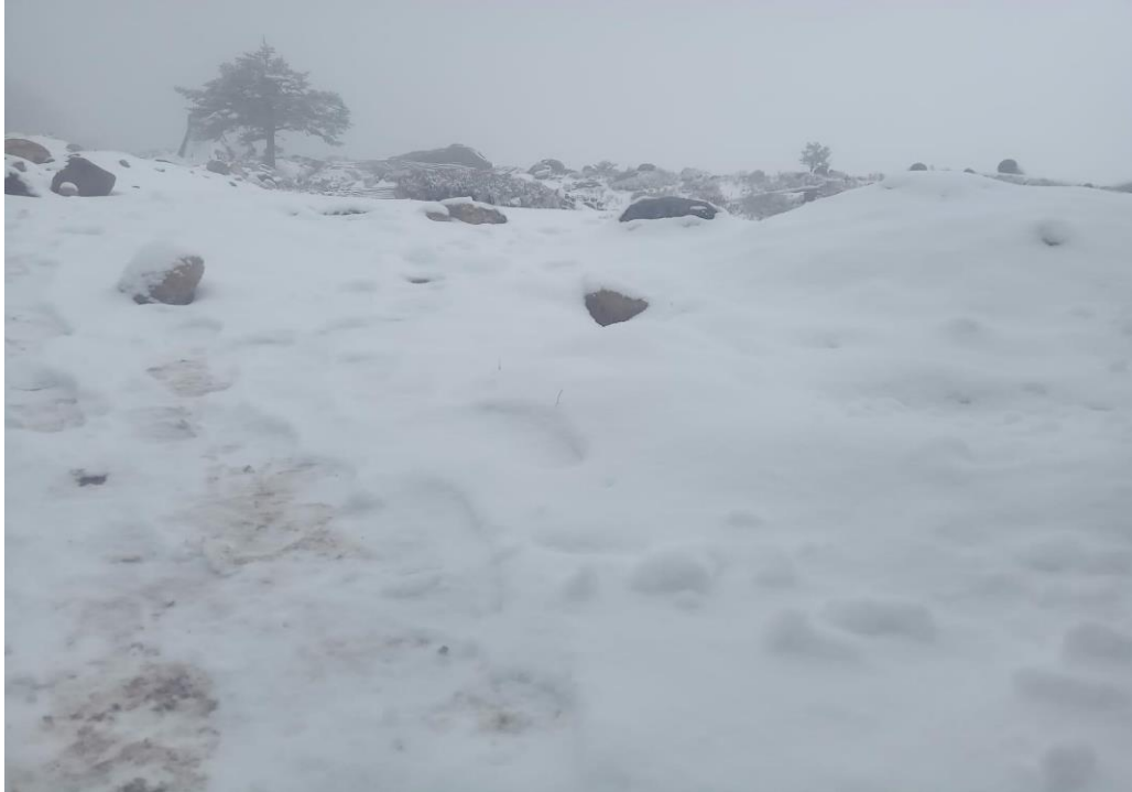
Figure 8: Work halted by Snowfall at the site during the month of April