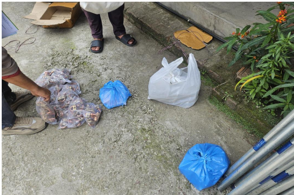
Figure 9: Components of Powerhouse Earthing System