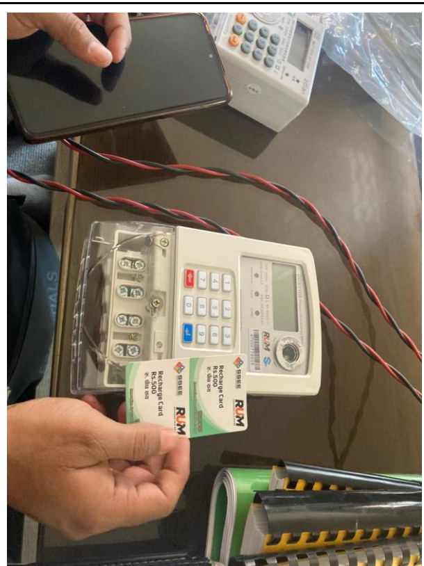
Fig 16. Visit at Smart Consult Pvt Ltd for Smart meter specification and functioning.