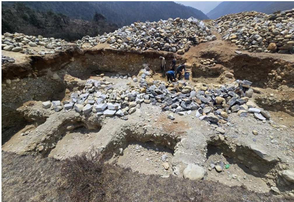
Figure 6 & 7: Preparation for footing of Powerhouse and Powerhouse Earthing System