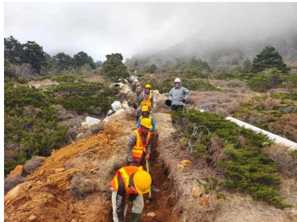
Figure: Labor are working at powerhouse site