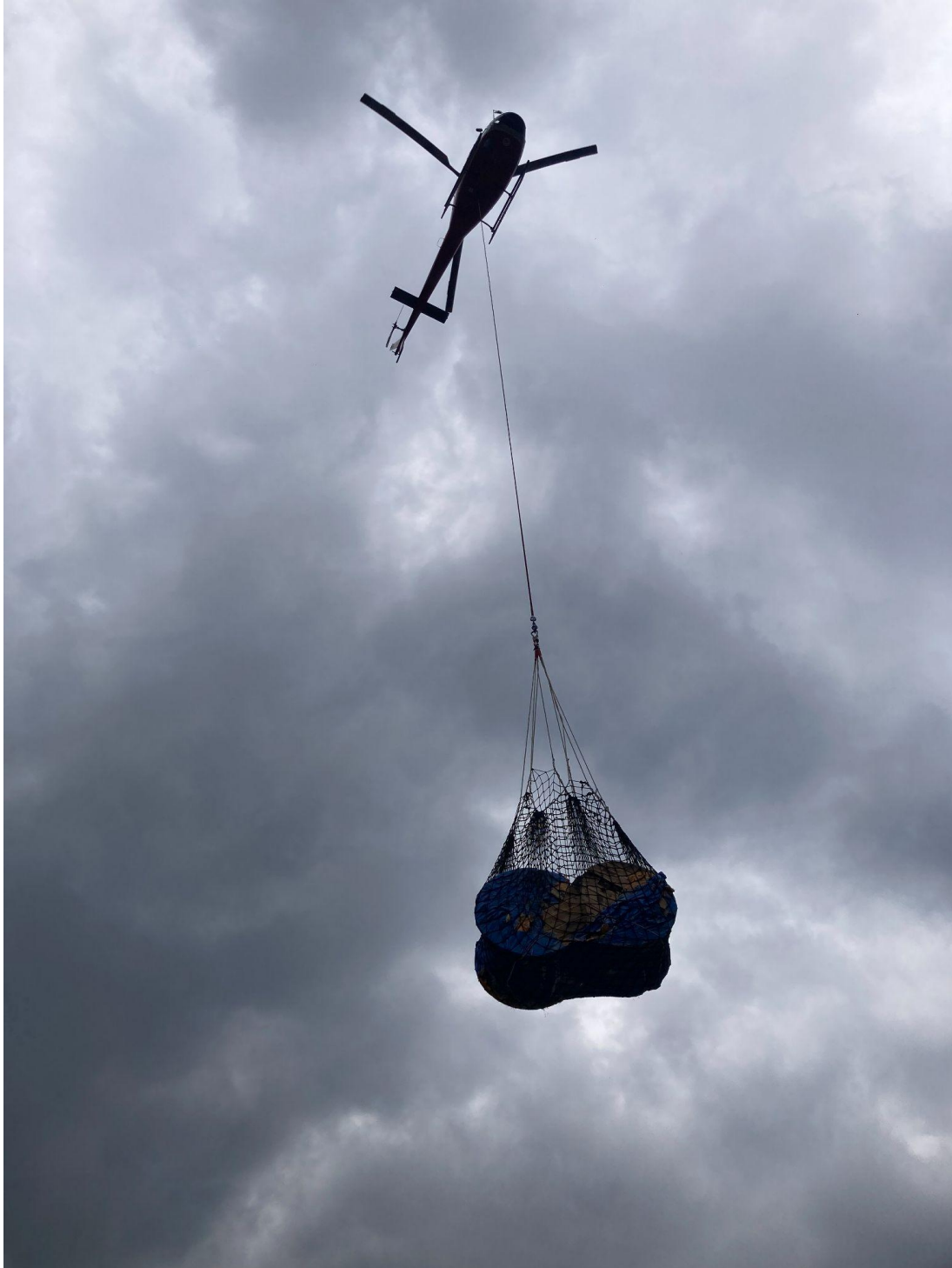
Figure 13: Airlifting of LT cable drums to site