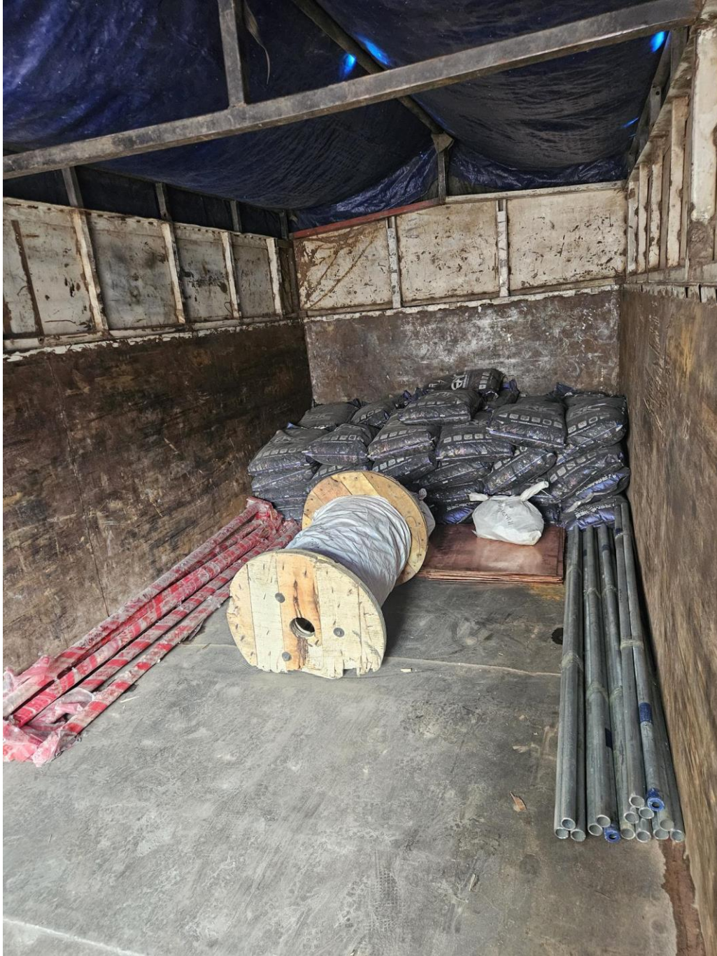
Figure 10: Transportation of Powerhouse Earthing Systems to roadhead, Surke from Kathmandu