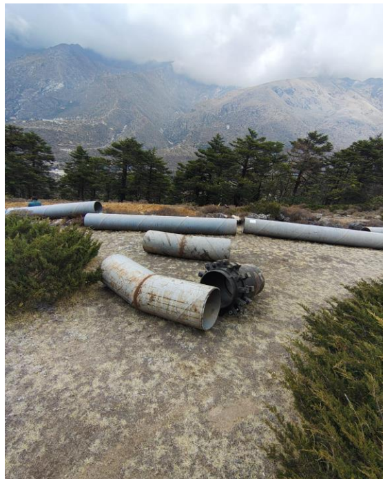
Figure 3, 4 & 5: Heli Transportation of Hydromechanical Material