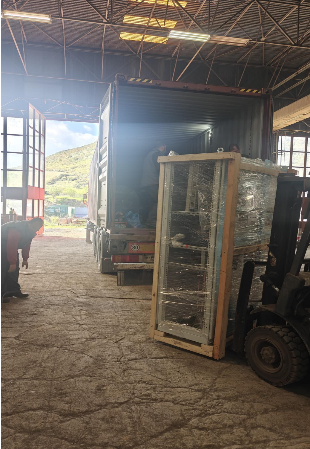
Figure 14: Packaging of EM components at Greece