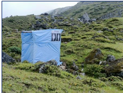
Figure: Toilet near the labor camp (Intake area)