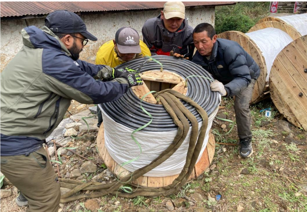
Figure 11 & 12: Transportation of LT cables from roadhead to Site