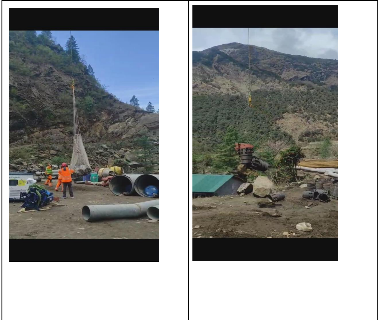
Figure 1 &2: Transportation of HM components from roadhead, Surke